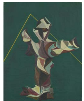
FUKUSHIMA Hideko, MP , 1950, Private Collection (Deposited to Artizon Museum, Ishibashi Foundation)