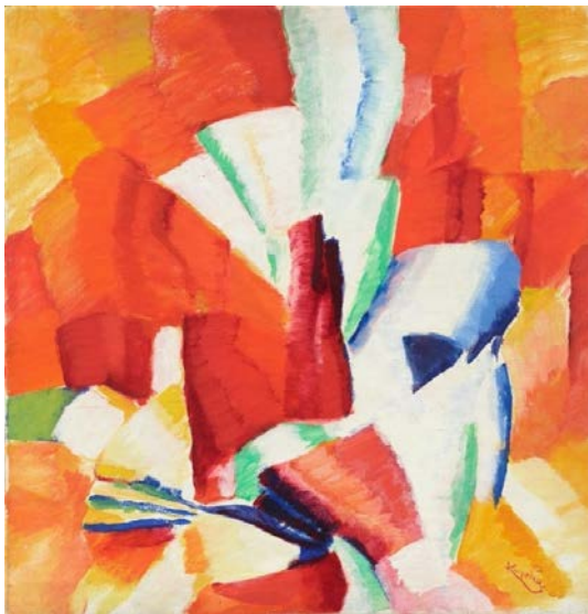
František KUPKA, Study on Red Ground , c. 1919, Artizon Museum, Ishibashi Foundation [Recent acquisitions]