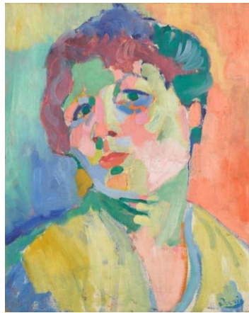
André DÉRAIN, Head of a Woman , c.1905, Artizon Museum, Ishibashi Foundation [Recent Acquisitions]