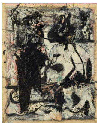
Willem DE KOONING, January , 1947-48, Artizon Museum, Ishibashi Foundation [Recent Acquisitions] ★ © 2023 The Willem de Kooning Foundation, New York/ ARS, New York/ JASPAR, Tokyo