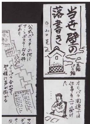
YAMAGUCHI Akira, Graffiti Today , 2021, collection of the artist

September 9 [Sat.] - November 19 [Sun.], 2023