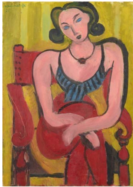
Henri MATISSE, Woman with Blue Bodice , 1935

The Artizon Museum has offered, through its Learning Programs, a variety of activities to enable people to become more familiar with works of art. This exhibition builds on the results of those programs to offer diverse ways of displaying groups of works selected from our collection. It consists of three sections: