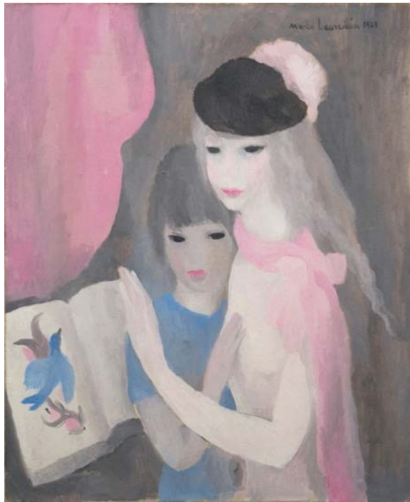
Marie LAURENCIN, Two Young Girls , 1923

December 9 [Sat.],2023 - March 3 [Sun.], 2024