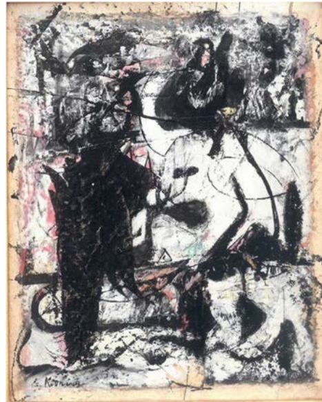
Willem DE KOONING, January, 1947-48, [New acquisition] ☆

From the late nineteenth century to the outbreak of World War I, France enjoyed its Belle Époque, a time of peace and prosperity. In a society brimming with a lively, free atmosphere that spurred artistic creativity, Fauvism, Cubism, and other new art forms bloomed in France at the beginning of the century. In time, those developments led to the birth of abstract painting, one of the outcomes of stylistic evolution in painting. Then abstraction shaped twentieth-century art world. This exhibition explores the history of abstract painting, and its ties to the future. Beginning around the time of abstract painting's birth, it presents abstraction's rise, trends flourishing, mainly in French painting before and after the war, and the rise of Hot Abstraction and Abstract Expressionism in France after the war. It also explores abstract art's simultaneous emergence in Japan, with the Jikken Kobo (Experimental Workshop), Gutai, and other movements, its multifaceted development, and its connections with the next generation.