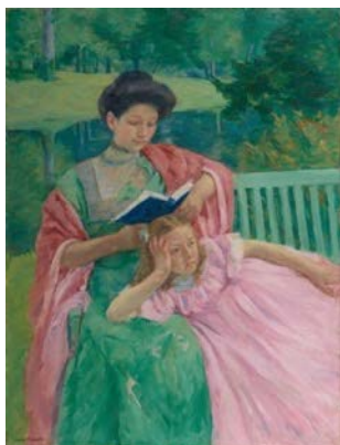
Marry CASSATT, Augusta Reading to Her Daughter , 1910

Women engaged in reading has been a theme in European art since the eighteenth century. Modern Japanese artists who studied in the West have also addressed that theme. This exhibition introduces works from the Ishibashi Foundation Collection depicting women reading, including paintings by Matisse, Cassatt, and Yamashita Shintaro.