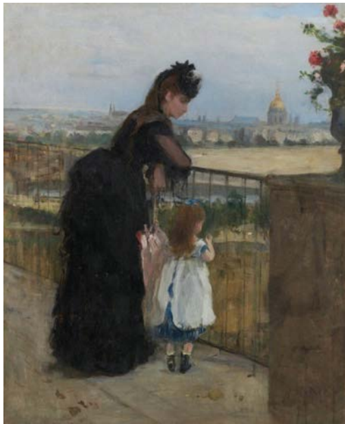
Berthe MORISOT, Woman and Child on the Balcony , 1872

February 25 [Sat.] - May 14 [Sun.], 2023