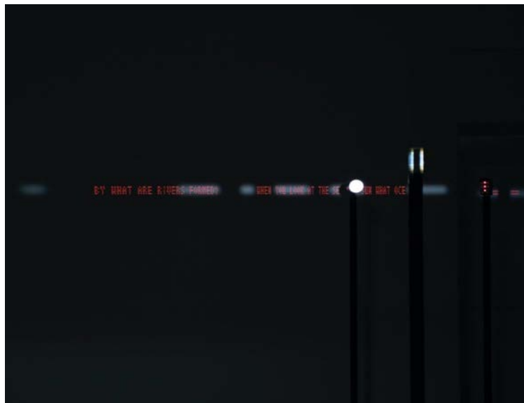
Dumb Type, 2022, Photograph by Takatani Shiro; © Dumb Type

February 25 [Sat.] - May 14 [Sun.], 2023