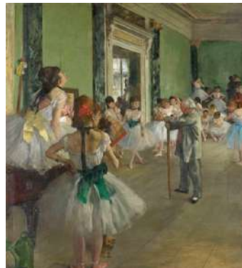
4. Edgar DEGAS, The Dance Class , 1873-76, Paris, Musée d'Orsay