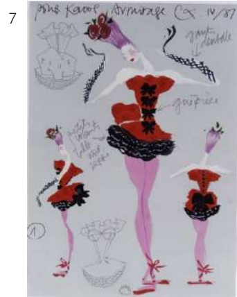
5. Poster of the first performance of Tannhäuser , 1861 ©Bibliothèque Nationale de France 6. Ida Rubinstein's Headdress in Scheherazade , c.1910 ©Bibliothèque Nationale de France 7. Christian LACROIX, Costume Design for Les anges ternis (Tarnished Angels) , c.1987 ©Bibliothèque Nationale de France