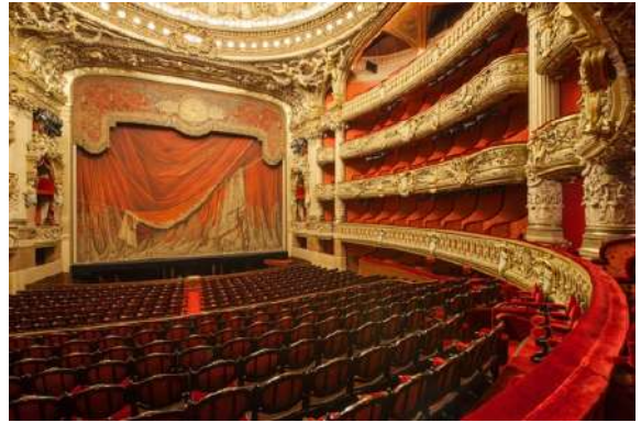
Interior of the Paris Opera House

France's iconic setting for musical theater performances, this gorgeous building in the 9th arrondissement of Paris was planned as one part of the modernization of Paris in the latter half of the nineteenth century and completed in 1875. The theater is called the Palais Garnier, after its architect, Charles Garnier. During the more than 350 years since its predecessor, the Académie Royale de Musique, was founded by King Louis XIV in 1669, it has always commissioned works that make possible artistic advances and innovations from librettists, composers, and artists. In 1989, a new theater, the Opéra Bastille, was completed. Today, both Opera Houses present ballets and operas, from the classics to contemporary works.