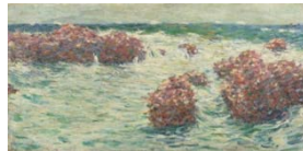
Right: AOKI Shigeru, Paradise under the Sea , 1907