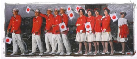
Right: MORIMURA Yasumasa, Study for M's Gift of the Sea (Color Matching02: And Then) , 2020