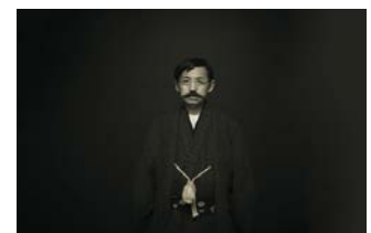
MORIMURA Yasumasa, Auto-Mythology , 2021 (video)

Screening of a video of the Auto-Mythology that Morimura disguised as Aoki.