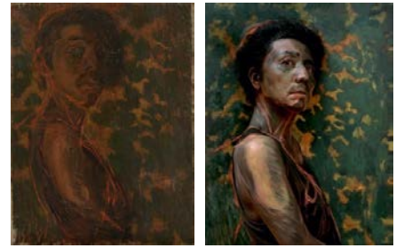
Right: Morimura Yasumasa, Self-Portrait/Youth (Aoki) , 2016/2021 ★