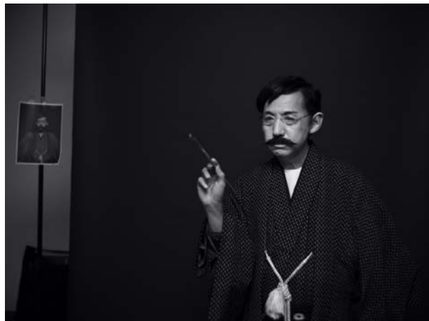
MORIMURA Yasumasa, Auto-Mythology , 2021 (video) ★

For our second Jam Session collaboration between the Ishibashi Foundation Collection and contemporary artists, the featured artist is Morimura Yasumasa. Morimura will present ten of his latest major works, created in response to Aoki Shigeru's A Gift of the Sea . In these original works, Morimura, acting alone, performs eighty-five individuals telling their stories. Those tales are from the Meiji(1868-1912), Taisho(1912-1926), and Showa(1926-1989) periods, the present, and the future, creating in effect a picture scroll that asks where we have been, where we are going, and what is the end of history?