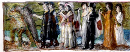
Left: MORIMURA Yasumasa, Study for M's Gift of the Sea (Color Matching01: Creation of an Appearance) , 2020