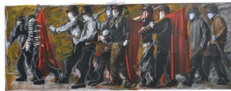
Left: MORIMURA Yasumasa, Study for M's Gift of the Sea (Color Matching05: Virus: The Day of Resurrection, 1) , 2021