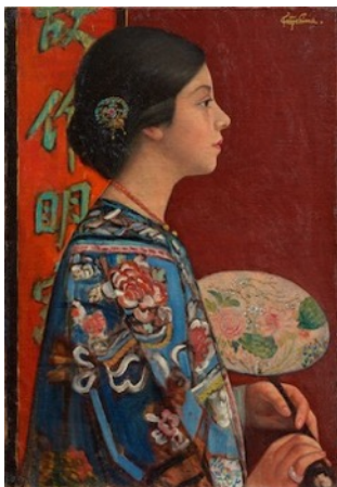
③ Fujishima Takeji, Orientalism , 1924