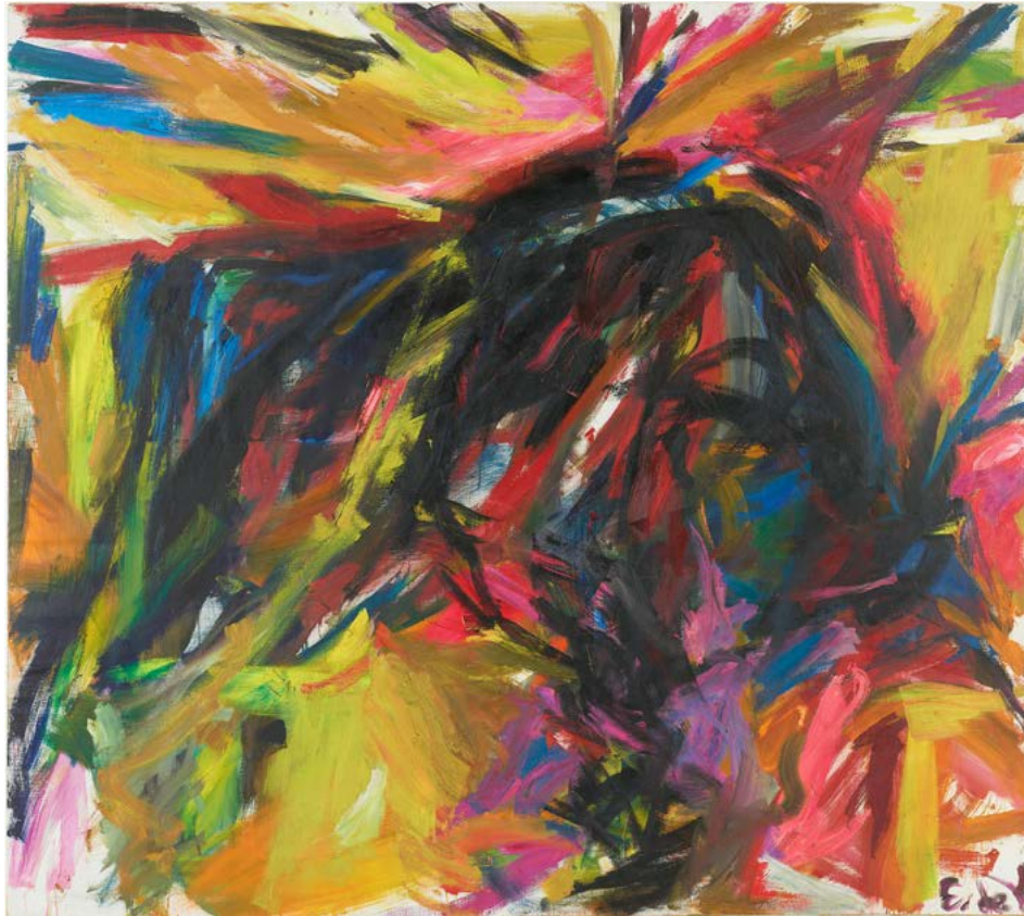
Elaine de Kooning, Untitled (Bullfight), 1959