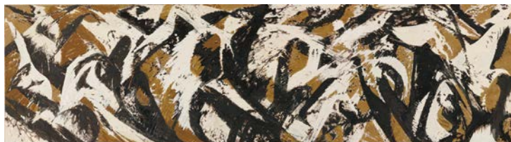
Lee Krasner, Moontide, 1961

Abstract Expressionism, which developed in New York after World War II, is an American avant-garde movement with international impact. While Jackson Pollock and Willem de Kooning are well-known figures, women artists also made major contributions. This section introduces work by Lee Krasner, Elaine de Kooning, Helen Frankenthaler, and Joan Mitchell.