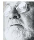
Portrait of Henri Matisse (From the Collection of Portrait Photographs of Artists)