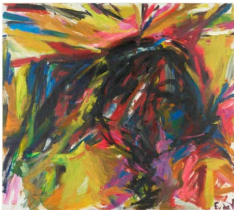
① Elaine de Kooning, Untitled (Bullfight), 1959

* Works ① and ② are still under copyright, but we have received permission to use them in publicizing this exhibition. In addition to the name of the artist and the title of the work, you must include the copyright statement.