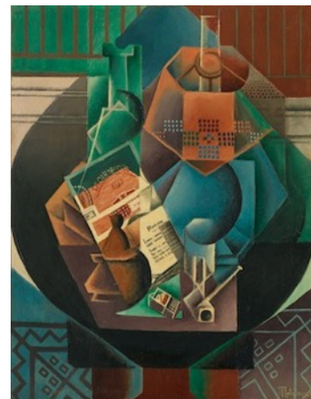
⑤ Jean Metzinger, Still Life on a Pedestal Table , 1916