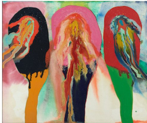
② Motonaga Sadamasa, Untitled , 1965 © Motonaga Archive Research Institution Ltd.