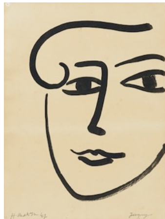
④ Henri Matisse, Jacquy , 1947