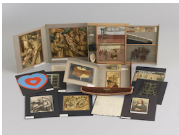
⑥ Marcel Duchamp, From or by Marcel Duchamp or Rrose Sélavy [Box in a Valise], Series B, 1952, 1946 (pencil drawing) C3379

* We will issue the copyright statement for use in the media later.